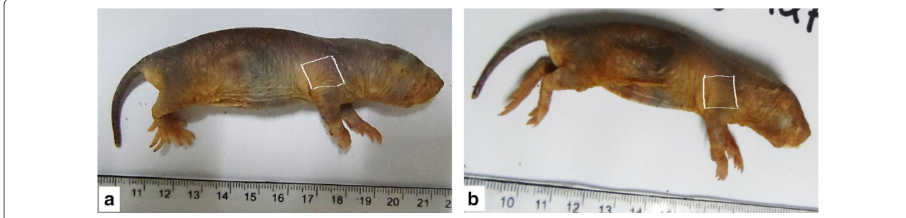
Fig. 1 NMR that received topical Vaseline (a) and IMQ (b) over the shoulder region (under the area marked with the white line). IMQ did not induce any changes in the skin. Calibrations are in centimeters